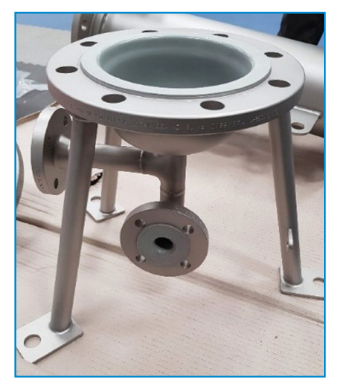
Example of 5mm ETFE rotational lining

Housing design in terms of geometry is critical in ensuring the chemically resistant coatings adhere correctly over the entire internal surface. This means ensuring adequate corner radiuses match to the coating type and internal welds are ground smooth. Amazon Filters have years of experience in housing design and will be happy to recommend the most appropriate solution for your particular process.