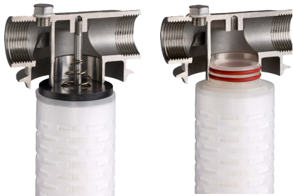
Double Open Ended

The 53 Series will accept the full range of Amazon and industry standard cartridges ranging from 0.1 to 500µm with nominal lengths of 5, 10, 20 and 30".