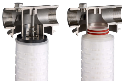
Double Open Ended

The 53 Series will accept the full range of Amazon and industry standard cartridges ranging from 0.1 to 500µm with nominal lengths of 5, 10, 20 and 30".