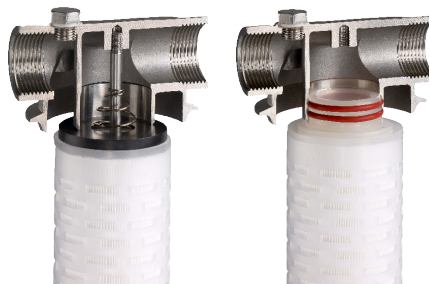
Double Open Ended