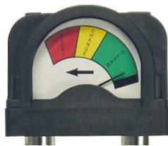
Differential Pressure Gauge