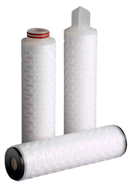
The SupaPore FPW cartridges are available in four grades with a full range of industry standard and junior lengths and end cap styles.

Its high filtration efficiency and dirt capacity makes it an excellent choice for use in almost all beverage processes.