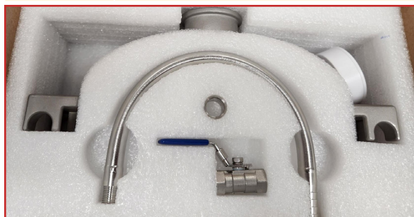
Safety Interlock as supplied