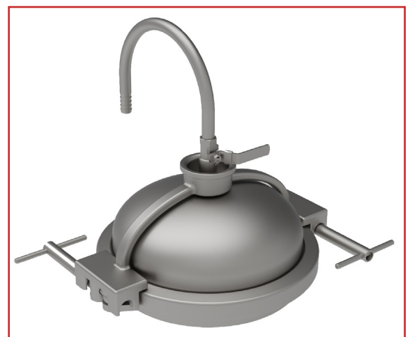
Safety Interlock in place on housing V-Clamp