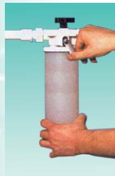
Disconnect and Remove

The SUPACHANGE encapsulated module can be changed without the operator coming into contact with the filter unit or process liquid. The change-out procedure is simply a matter of loosening a single thumb bolt, sliding a C-Clamp and inserting the new filter module.